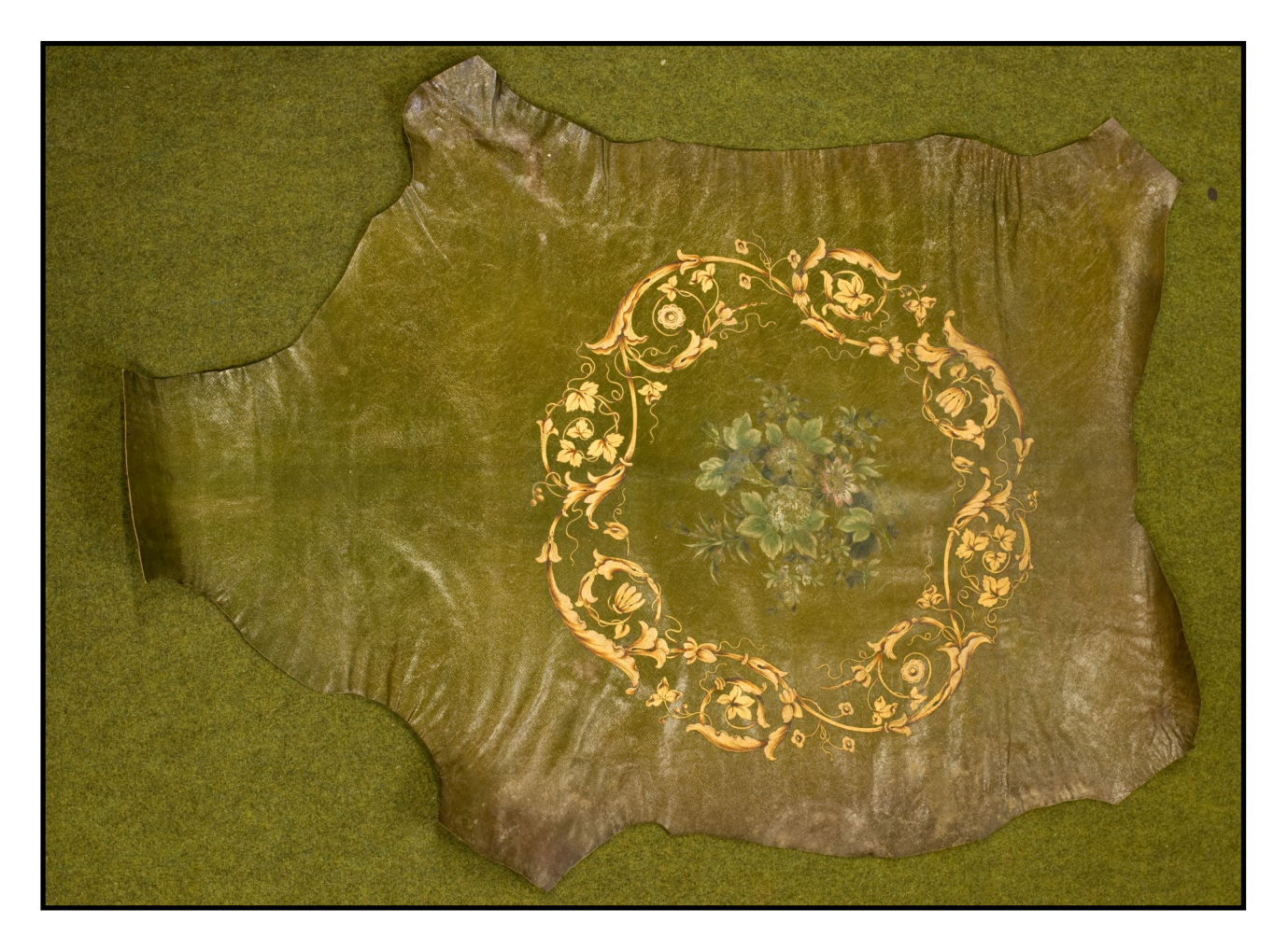
The Moroccan hide on the clean carpet

We received a spectacular donation from a former director of Deed's Mill – a full Moroccan hide decorated and gilded and in superb condition considering it was apparently displayed at the 1851 Great Exhibition. We are currently taking professional advice as to how best it could be displayed. A set of scales and an embosser used by the mill were also given to us.